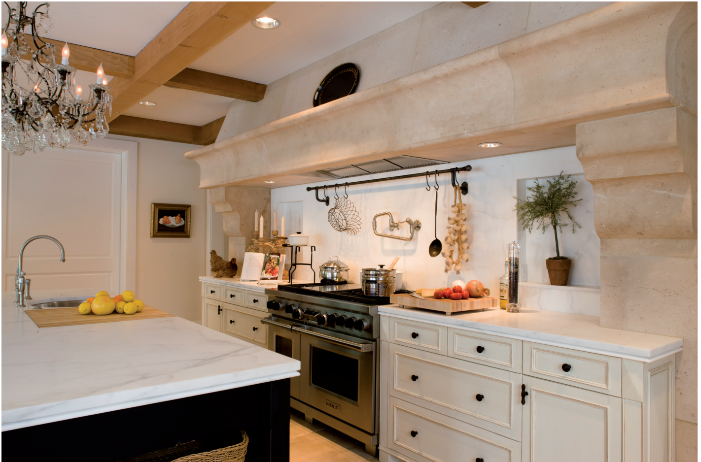
Tobias Design is celebrating an honor from the website Houzz.com.

T obias Design at 48 West Broad Street in Hopwell was recently the recipient of a “2014 Best of Houzz” Award by Houzz.com, the popular website for home remodeling and design. The Best Of Houzz award is given to photos that are the most popular among the more than 16 million monthly users on Houzz, known as “Houzzers,” who saved more than 230 million professional images of home interiors and exteriors to their personal “ideabooks.”