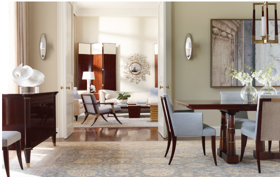
Gasior’s Furniture is marking its 35th anniversary with special sales in October.

“Montgomery was chosen as a new location to not only bring a much-needed